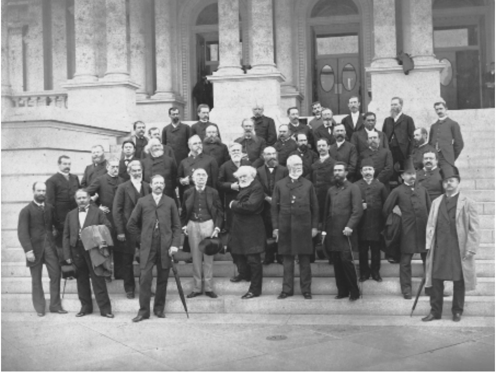
Fig. 2: Conference delegates on the steps of the State-War-Navy Building. International Meridian Conference, Washington, D.C., 1884.

temporal variety surfaces because Pane executes a performance score of limited activity and ‘animaterial action’—measuring steps and the ground by sustaining an incredibly restricted mode of movement. Only thrust into the durational can the highly constricted score generate new rhythms. In one way, the durational is offering Pane a suspension or escape from capitalism’s mandates around work and progress, the 24/7/365 rhythm and mechanisation of the body that the May ’68 Events of Pane’s present caution are on the horizon: ‘[m]étro, boulot, dodo’. The durational also calls the body to sense and perceive temporal variety. Crumbling, folding, sidestepping, falling, there is an abundance of temporal variety and very little measure in Pane’s work. It is this aspect of Pane’s performance that, as early as 1969, pursues an intersectional queer crip feminist aesthetics (the durational) and finds fleshy folds